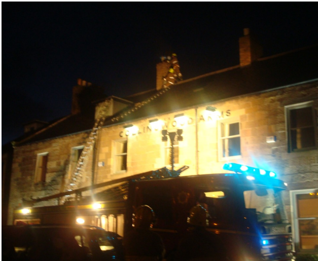
Fire-fighters successfully put out a chimney fire at the hotel.